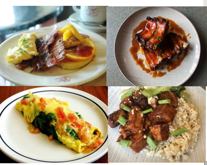
Wednesday BBQ Pork Ribs BBQ Tofu Macaroni & Cheese Roasted Broccoli