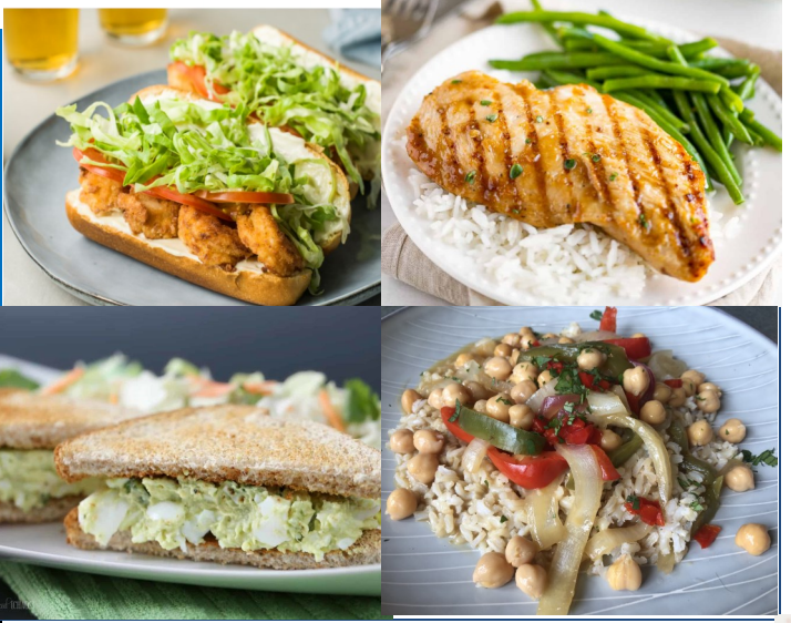
Monday Dinner Teriyaki Chicken Orange Ginger Chickpea Stir Fry Jasmine Rice Bok Choy

Shrimp Po Boy Avocado & Egg Salad Sandwich Corn Roasted Baby Carrots