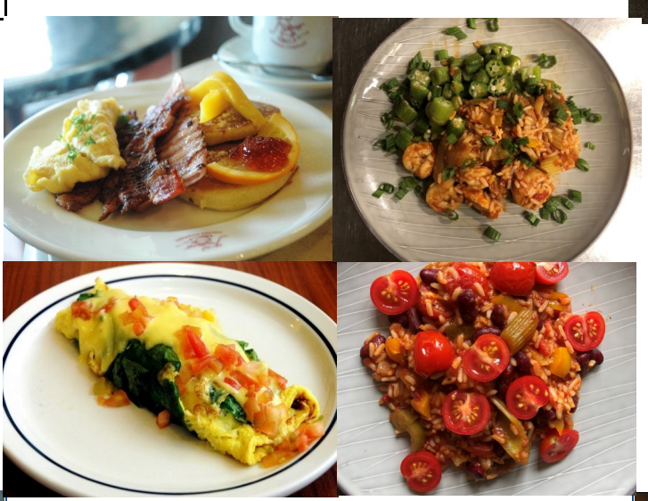
Thursday Creamy Balsamic Chicken Stuffed Spanish Eggplant Egg Noodles Asparagus