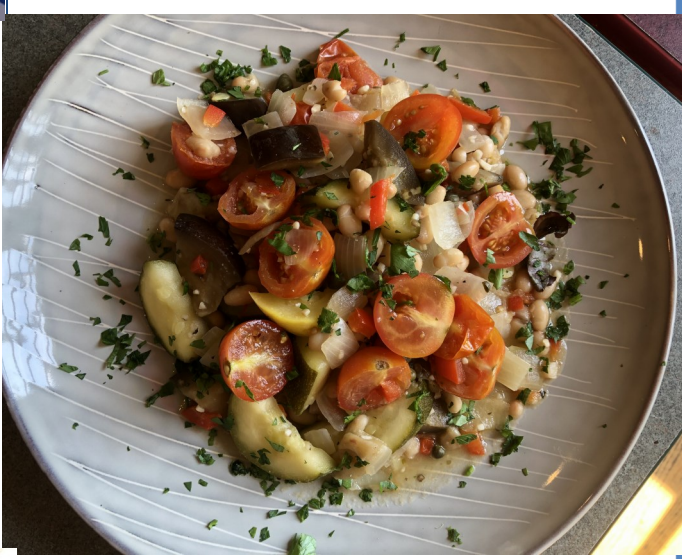
Wednesday Jambalaya Veggie Jambalaya Cornbread Collard Greens