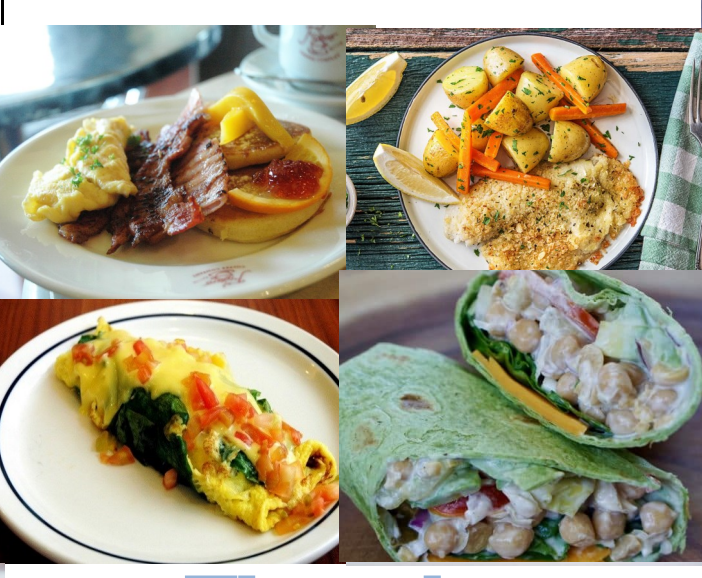
Wednesday Fish & Chips Chickpea Salad Wrap Roasted Potatoes Green Peas