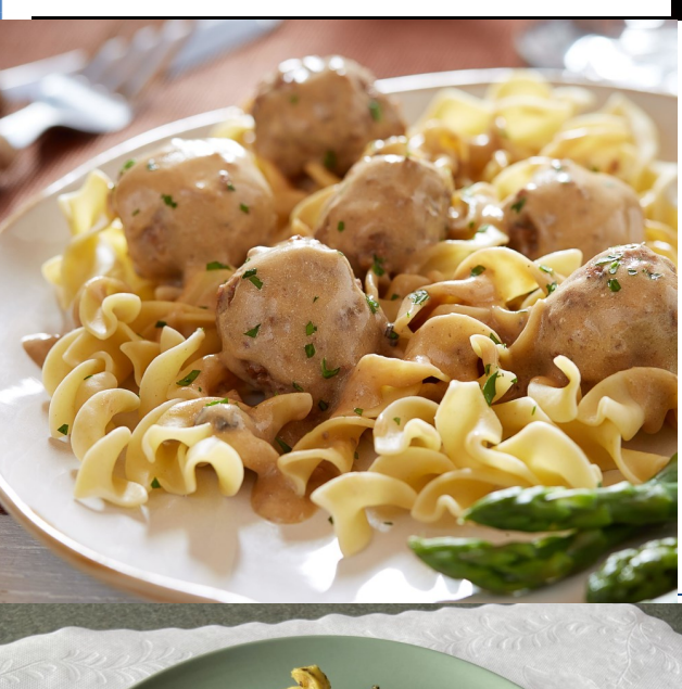
Thursday Swedish Meatballs Eggplant Parmesan Egg Noodles Broccoli